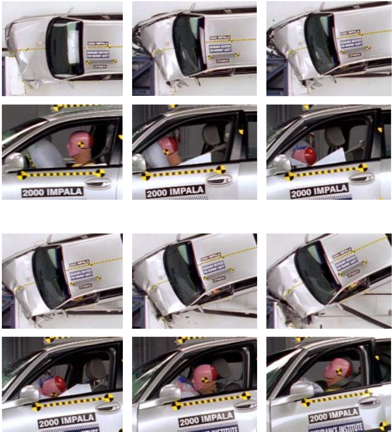
Figure 1. An example of good performance, the 2000 Chevrolet Impala (CF99014). Dummy movement was well controlled. After the dummy moved forward into the airbag, it rebounded into the seat without its head coming close to any stiff structure that could cause injury; the dummy's head contacted only the head restraint.