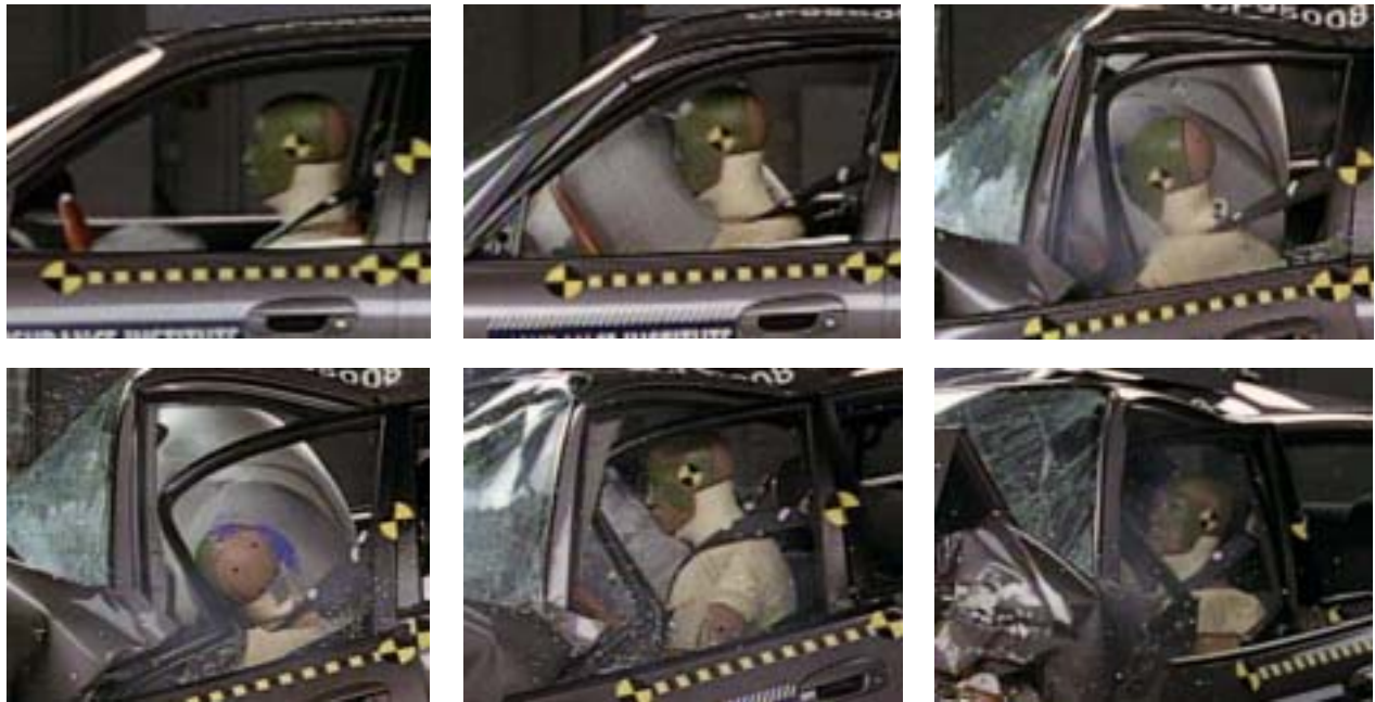
Figure 6. An example of poor performance, the 1995 Mitsubishi Galant (CF95008). The dummy rotated around the left side of the airbag. Its left shoulder hit a sharp edge of the buckling window frame, which could cause lacerations, and its head hit the window frame.