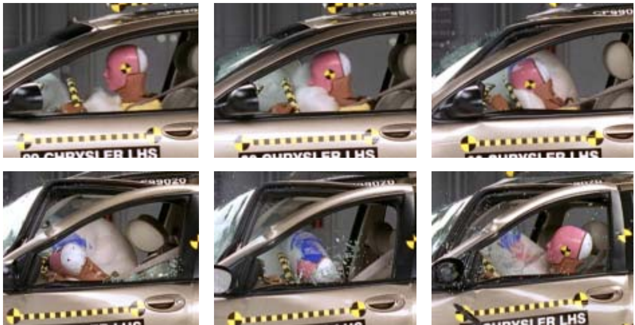
Figure 7. Another example of poor performance, the 1999 Chrysler LHS (CF99020). The airbag deployed too late, allowing the dummy's head hit the steering wheel directly.