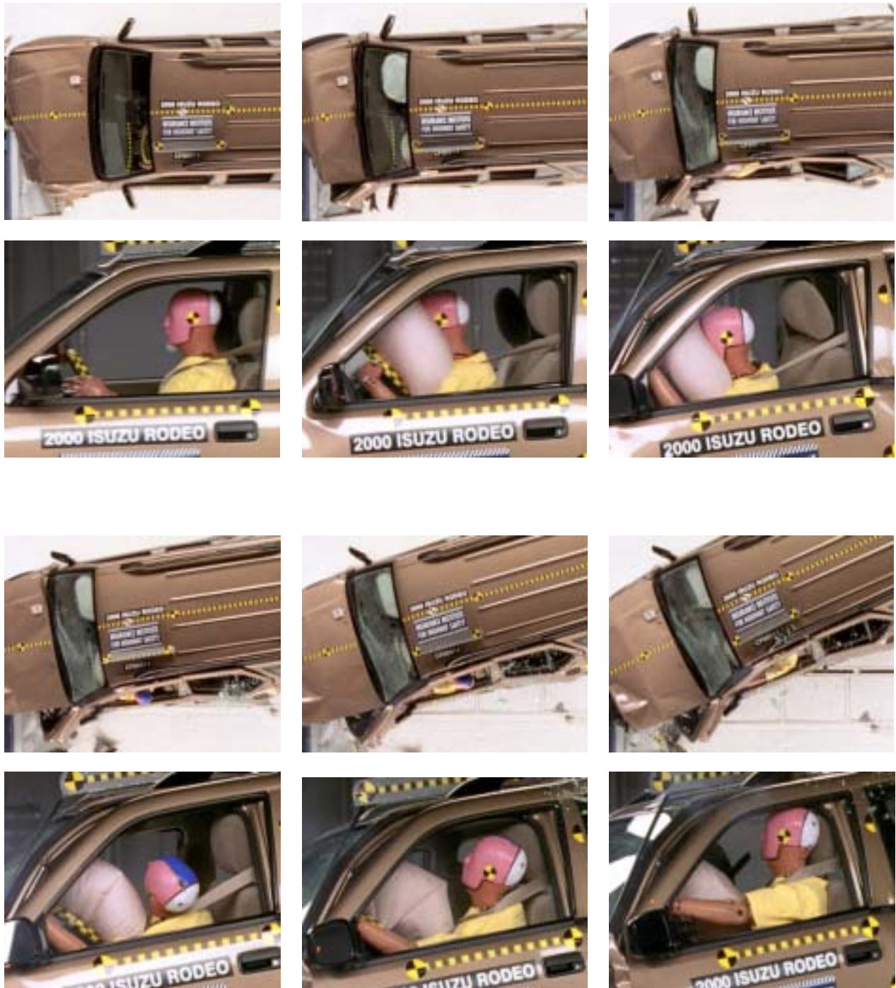
Figure 5. An example of marginal performance, the 2000 Isuzu Rodeo (CF00014). During rebound from the airbag, the dummy moved toward the driver door. Its head leaned through the open side window and approached but did not contact the window sill. In combination with sufficient rotation of the upper torso for the head to face nearly upward, this motion lowered the rating to marginal.