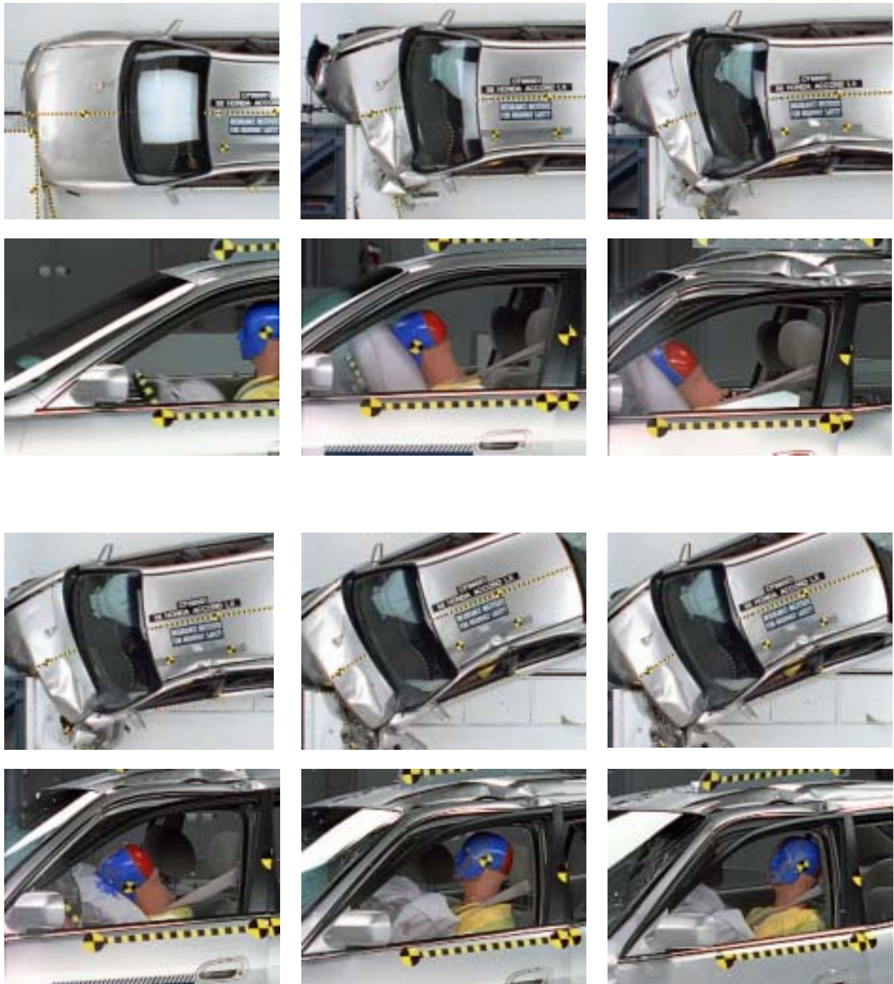
Figure 2. Another example of good performance, the 1998 Honda Accord (CF98001). As in the 2000 Chevrolet Impala, dummy movement was well controlled. After moving forward into the airbag, the dummy rebounded into the seat without its head coming close to any stiff structure that could cause injury.